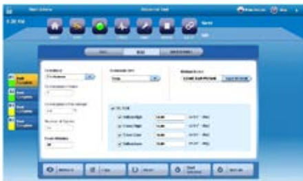
Modulated IR Sensor